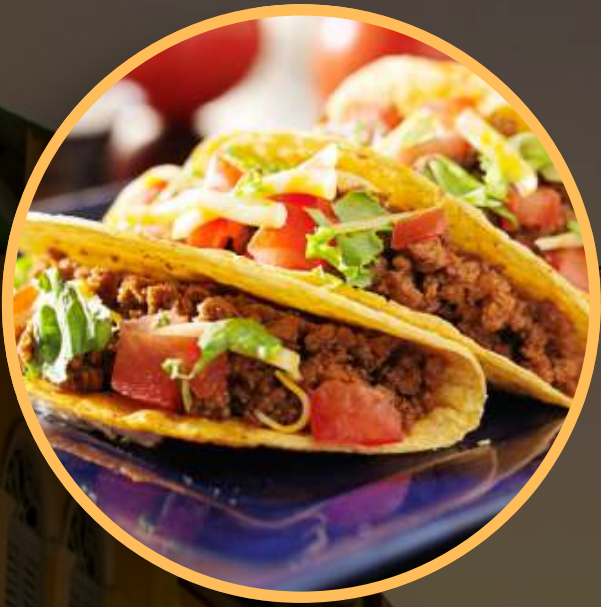
Beef Tacos (3 pcs) $12.9