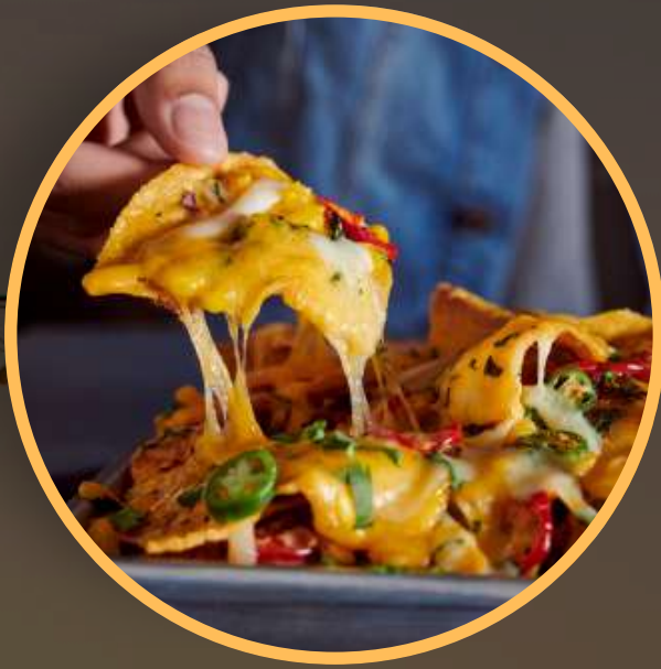
Loaded Nachos $16.9