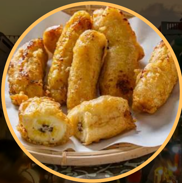
Goreng Pisang, 5pcs (Banana Fritters) $9