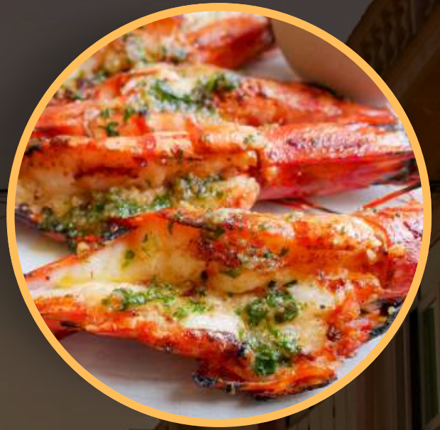
Garlic Butter Jumbo Prawns (3 pcs) $24