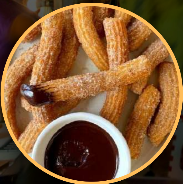
Churros (5 pcs) $10.9