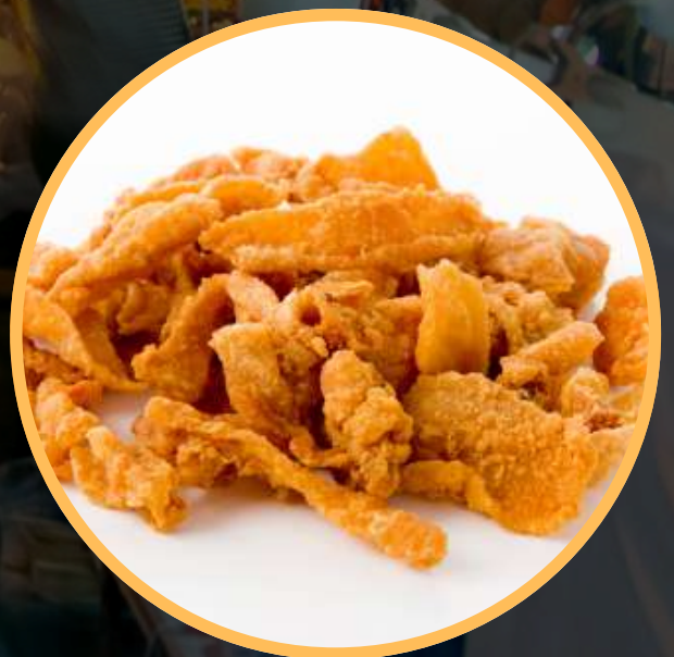
Chicken Skin $11