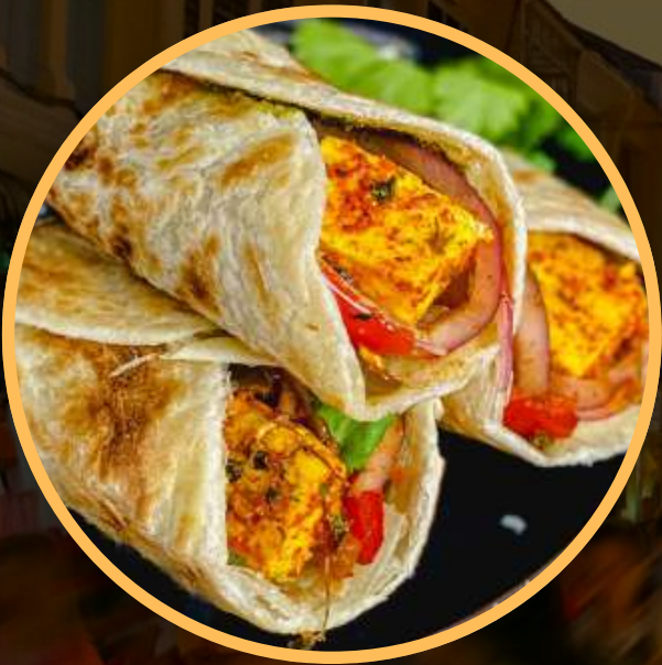
Paneer Tikka Wrap (1 pc) $9