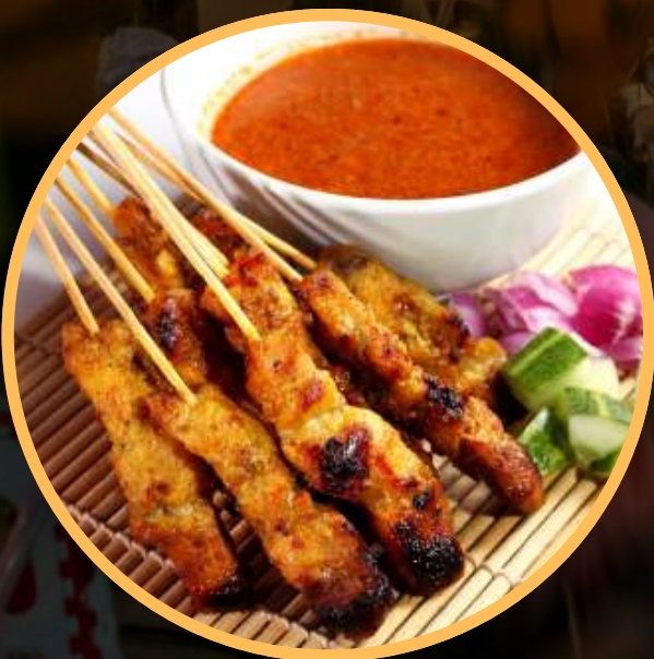
Chicken Satay (Charcoal, 10 sticks) $14