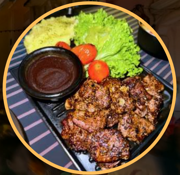
Beef Cubes $27